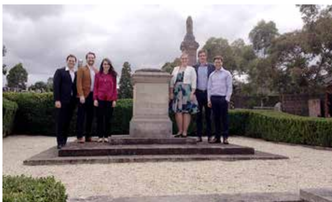
Melba Opera Trust scholars at Lilydale Cemetery.

“Our ‘Melba Pilgrimage’ was the perfect way to really begin to understand the wonderful legacy that Melba Opera Trust aims to continue. As a returning scholar