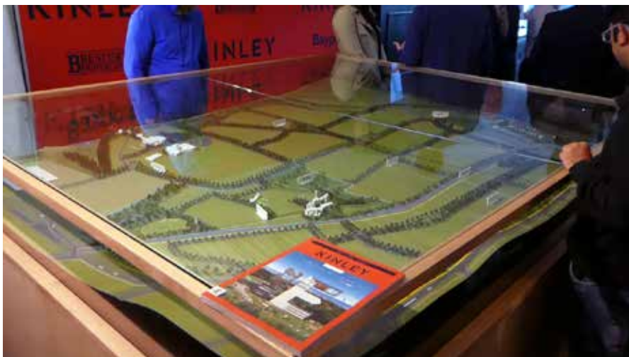
The three dimensional model of the Kinley development of the former Cave Hill site on Saturday, October 20, 2018.

If you want to find out more information about the society, our local history, its people and places or about Dame Nellie Melba go to: www.lilydalehistorical.com.au or www.nelliemelbamuseum.com.au