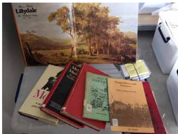
A selection of some of pre-loved books which will be for sale on December 8 and 9 from 11am.

Footnote: Thanks to the efforts of Judy Macdonald, our library now boasts more than 450 items and index entries of quite a few of those books now total 26,673.