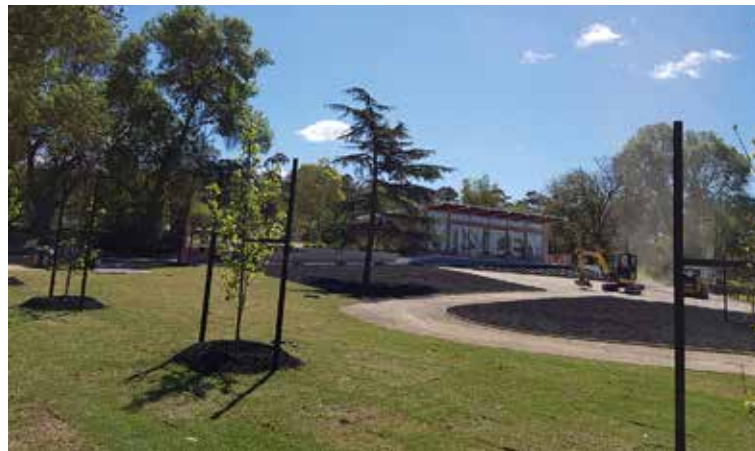
The former Cave Hill Cricket Club pavilion and oval have been transformed by Kinley Estate. For launch details see page 5.