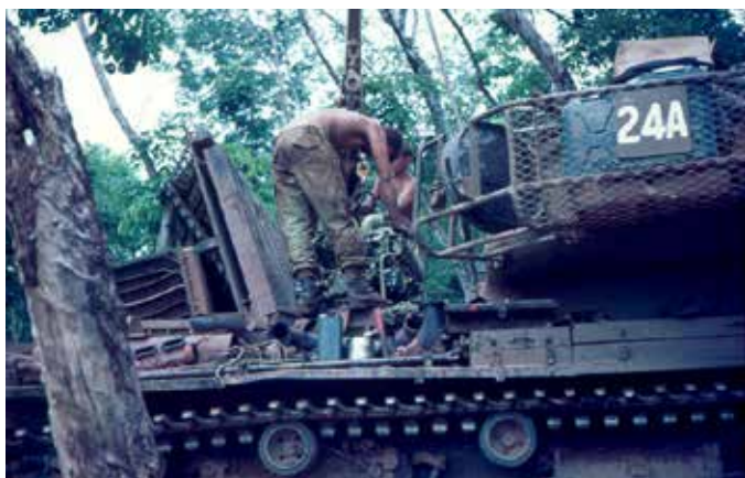
Repairing a tank in the Vietnamese jungle.

For bookings call Lorraine Smith 9735 1104.