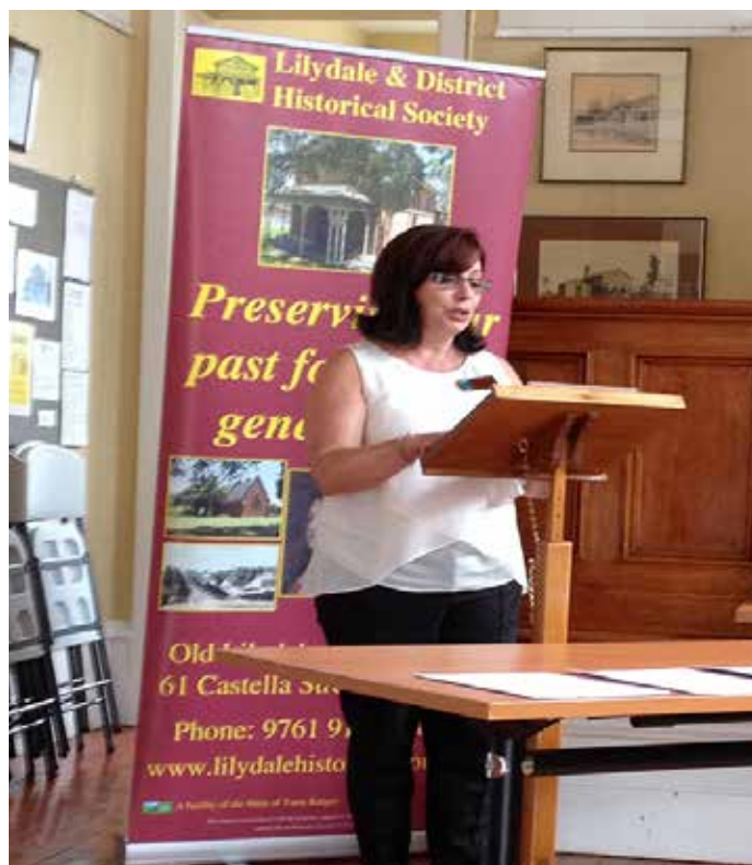
Above: Yarra Ranges Mayor Maria McCarthy.

The cost is $10 and it can be purchased from the court house or online.