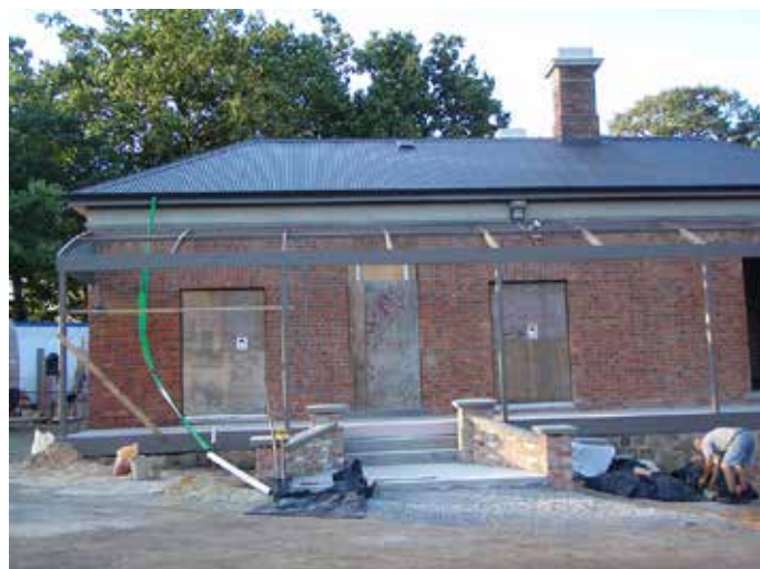
Clockwise from top right: