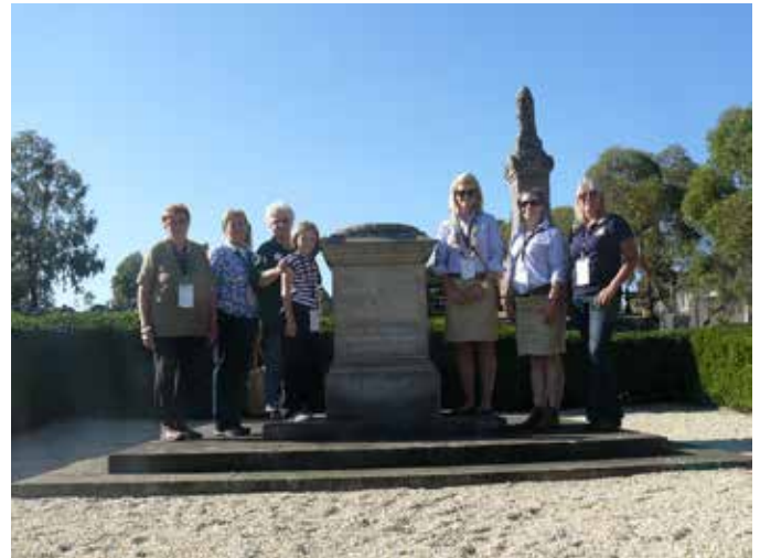
Some of the country visitors in town for the Women on Farms weekend which included a Melba tour.