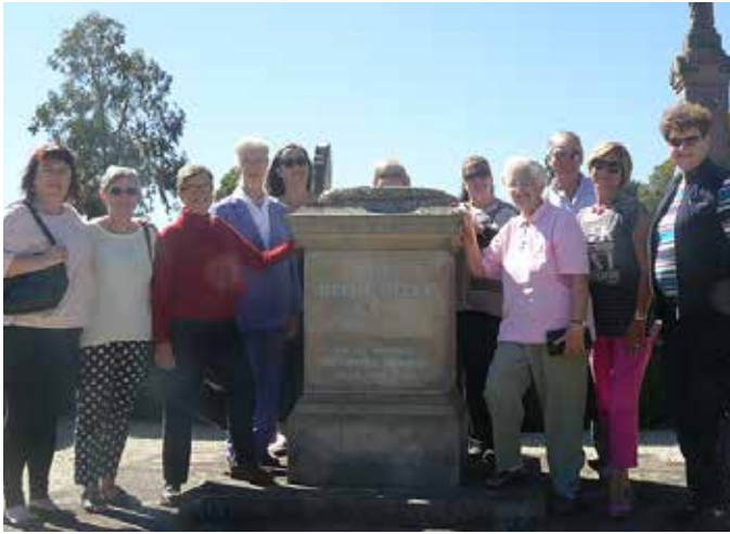
RACV members dropped into the Old Lilydale Court House for a short Melba talk and later visited Melba's grave at Lilydale Cemetery.