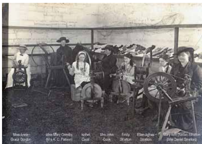
The Ballangeich and Ellerslie Red cross, Warrnambool Show, November 1917.