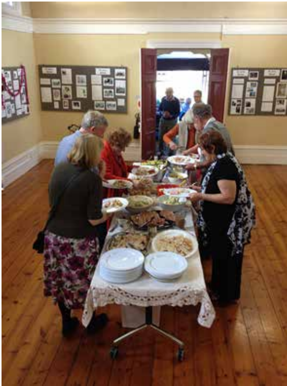
Above: Our Christmas tables laden with our first course of roast turkey and salads.

Go to page 5 for just one of our 400 headstones' stories.