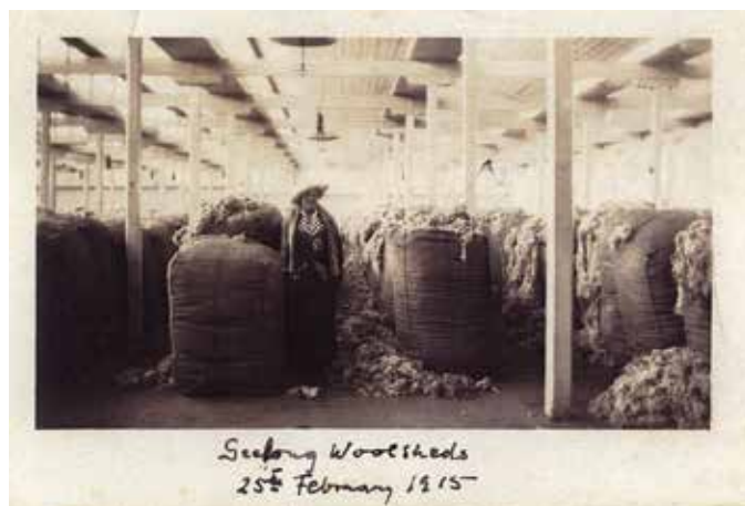
Melba in front of Mrs Petersen's wool bales at the Geelong wool stores.