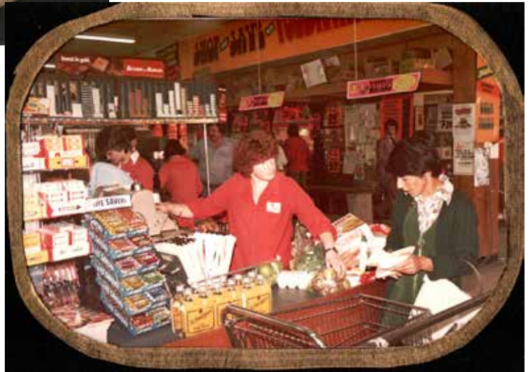
07010 The check out area of Brown & Hawkey's Supermarket.