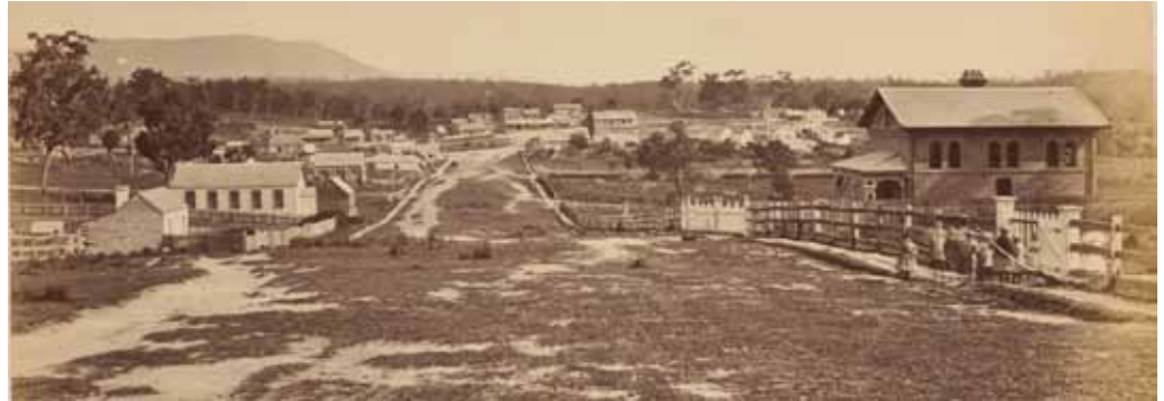
Charles Nettleton photo of Lilydale with the Dandenong forest in the distance, Victoria, ca. 1877. (National Library of Australia nla.pic-vn3916415-s43 PIC/11202/43 LOC Album 1114).

All meetings are held on the 1st Saturday of the month (except January) commencing at 1 pm at the Athenaeum Theatre Castella St., Lilydale.