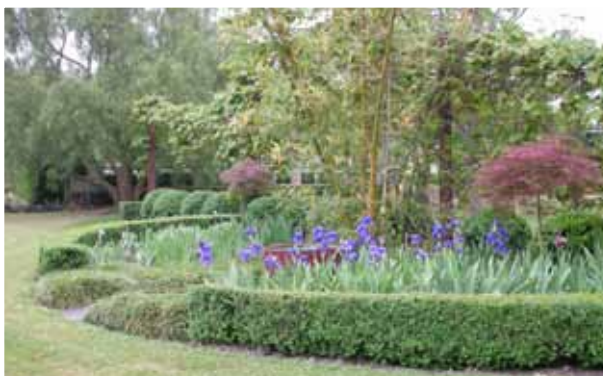
Hedges and the dry creek bed (below) are key features of the one-hectare Wallace Garden.

After eating and wandering the garden, guests can look at the display of classic English vehicles courtesy of