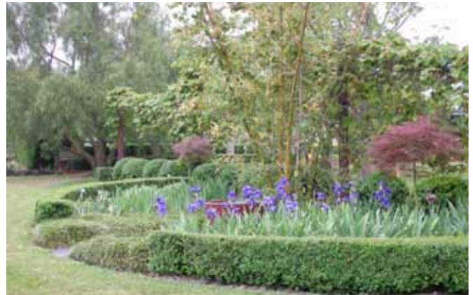
Hedges and the dry creek bed (below) are key features of the one-hectare Wallace Garden.

The garden is at 7 Maddens Lane, Coldstream Melway Ref 277 A11.