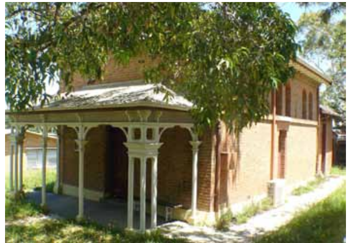
The society's new home at the old Lilydale Court House, 61 Castella St, Lilydale.