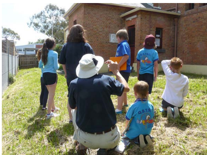
The students from Queensland School for Travelling Show Children sketching our building.

Being on duty at the court house can be a lot of fun as you never know who is going to walk through the door. While everyone was gearing up for the Lilydale Show in late November, a group of children and their teacher landed at the court house.