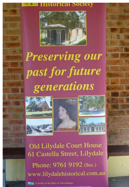
The society's new promotional banner.

The society thanks the RHSV and the Vera Moore Foundation for the grant.